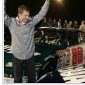
NASCAR Finally Starts