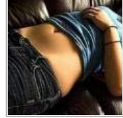
The use of pharmaceutical grade fish oil ...