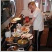
Oven Baked Eggless Zucchini Fries