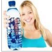
I BELIEVE in bHip Global