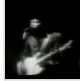
Jimi Hendrix: A of the Last Century Experience